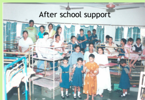
After school support