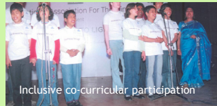
Inclusive co-curricular participation