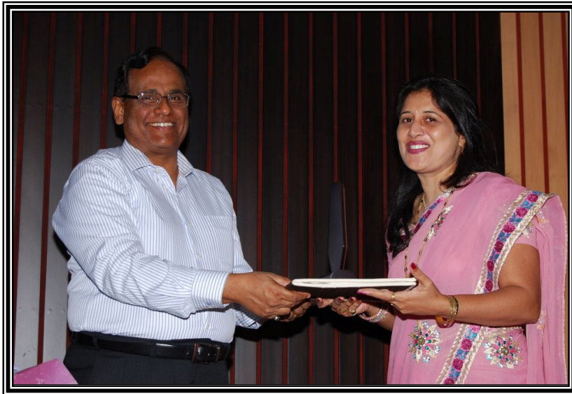
TMF honoured outstanding MCD teachers in New Delhi